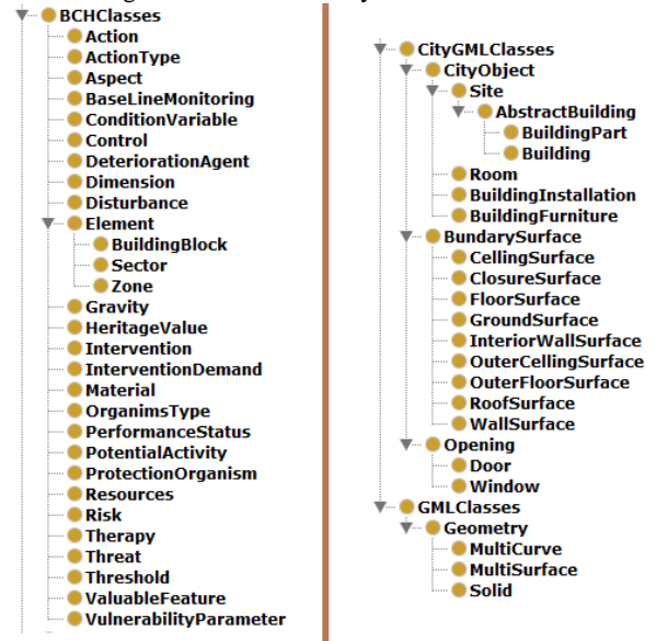
Figure 2: Basic taxonomy for BCH-domain.