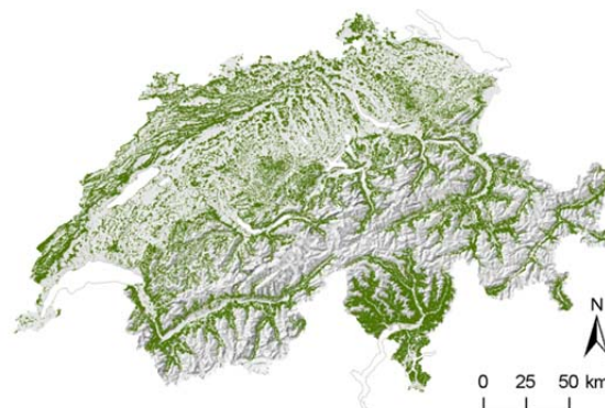
Figure 1: Forest distribution in Switzerland.

In this study, the forest road network in Switzerland is examined and its adequacy for efficient timber transport is evaluated, taking into account that each forest road is capable of carrying only vehicles of a certain maximum size.